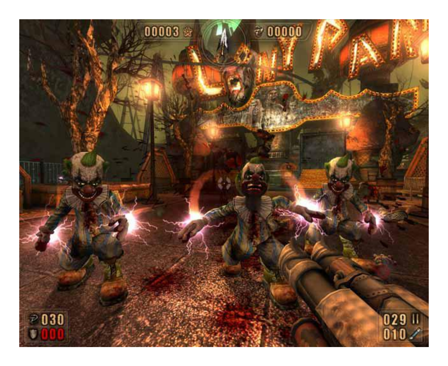
Download ->>->> <a href="http://bit.ly/2QV0yaE">http://bit.ly/2QV0yaE</a>

Painkiller: Black Edition Free Download Install